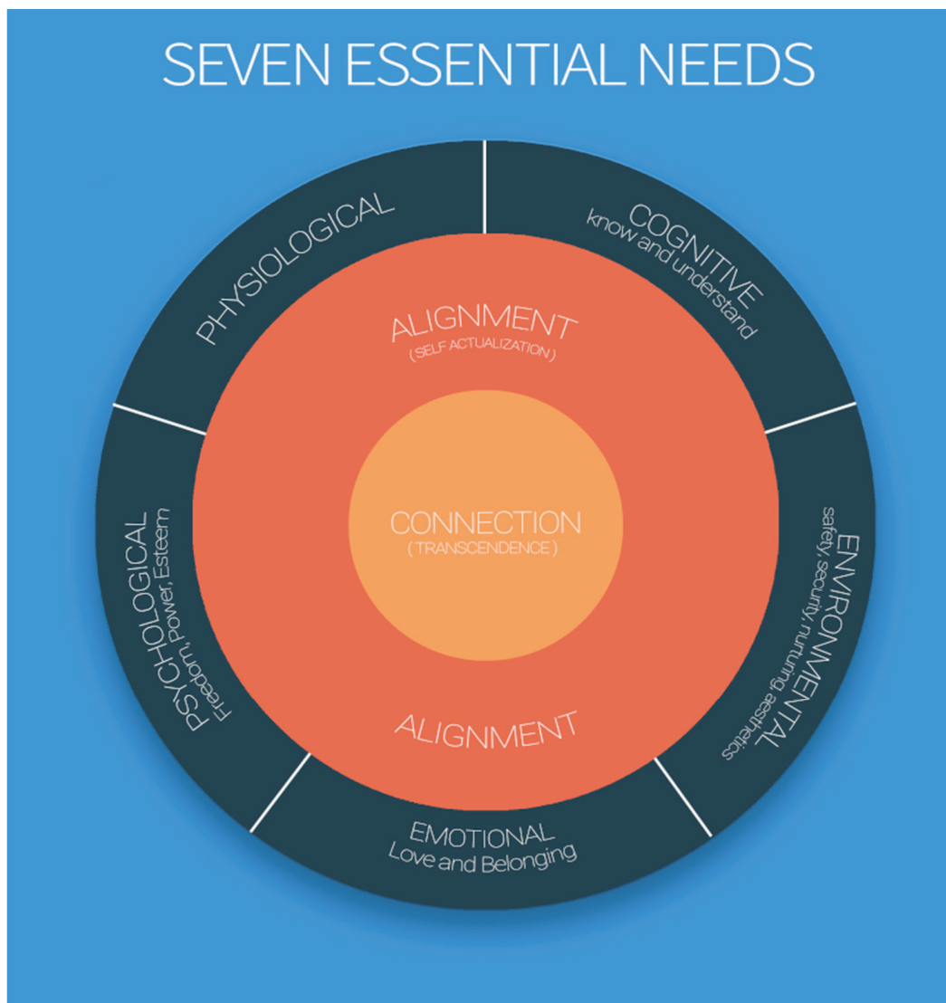
Figure 1. The Circle of Seven Essential Needs

Where did this circle of needs come from? It is inspired, in part, by Abraham Maslow's career-spanning efforts to provide a comprehensive list of human needs. His attempt began in 1943 with the publication